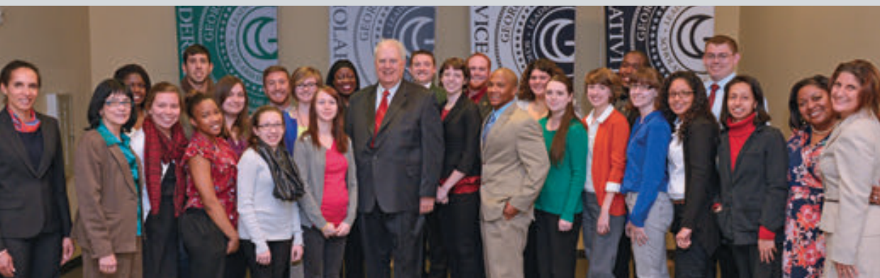
At left: Former Georgia Governor Roy Barnes pauses for a portrait with members of GGC's Honors Program. Barnes had a private luncheon with the group before presenting a special lecture to the campus community.