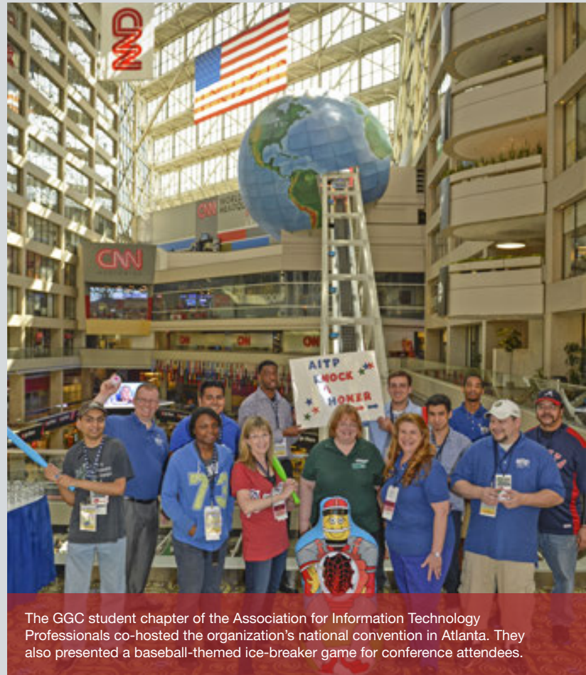
The GGC student chapter of the Association for Information Technology Professionals co-hosted the organization's national convention in Atlanta. They also presented a baseball-themed ice-breaker game for conference attendees.