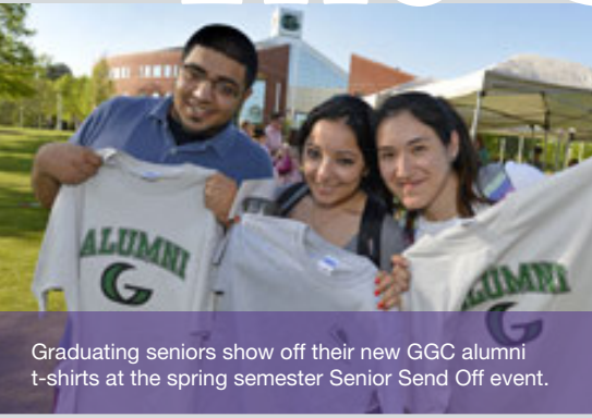
Graduating seniors show off their new GGC alumni t-shirts at the spring semester Senior Send Off event.