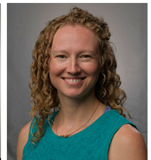
Exhibition at Sheridan College, left, and Stone-Collins, right.